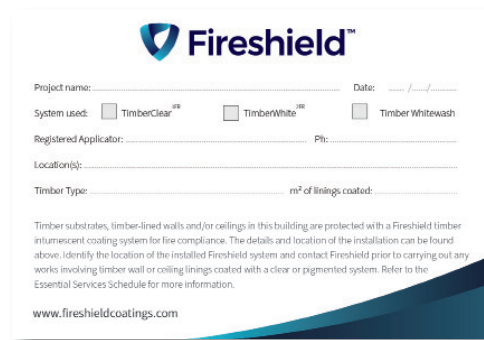
Large product description label to be installed in the switchboard cupboard serving the coated area and one small product label on or in close proximity to the coated surface. (Compulsory in Australia)

Leave a copy of the Fireshield® Maintenance Guide on-site with the Main Contractor or Client.