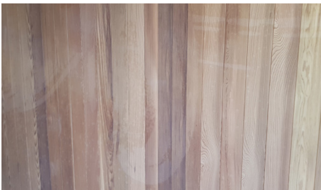
This photograph shows an example of contamination left on the timber surface and then clear coat applied leaving visible marks on the surface.