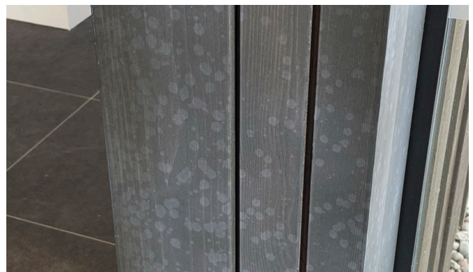
Photograph shows an example of "blotching" due to application outside of the conditions listed on the product datasheet.